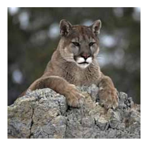
14 WESTERN WILDLIFE